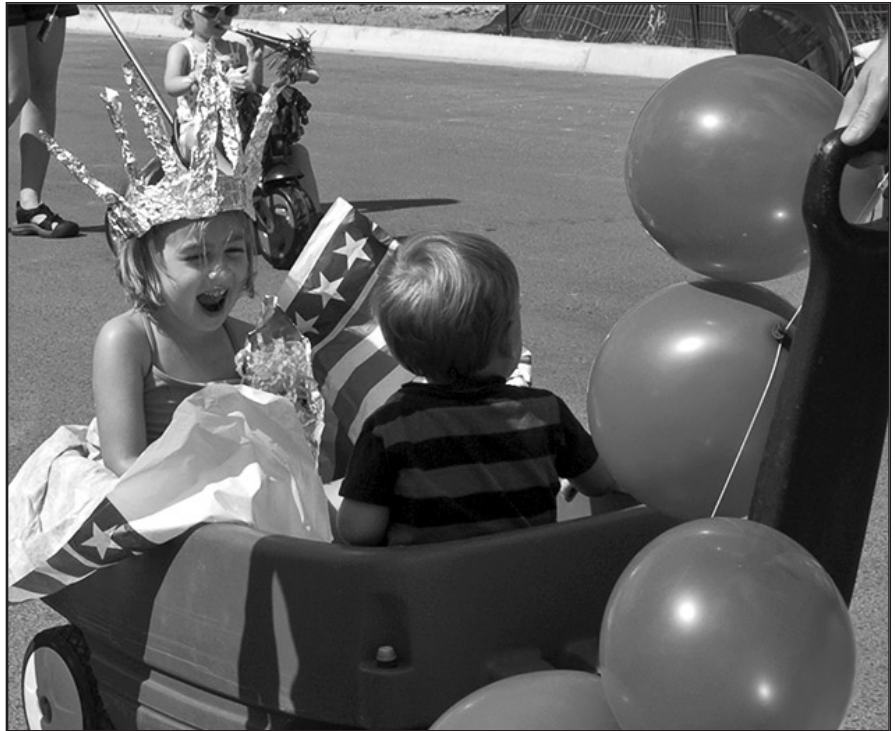
Neighborhood children enjoy the first annual Fourth of July parade

Let us know if you are interested in contributing an article or underwriting our next issue!