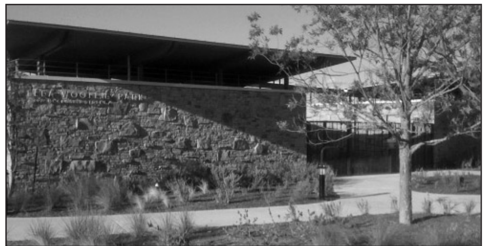
Ella Wooten Park